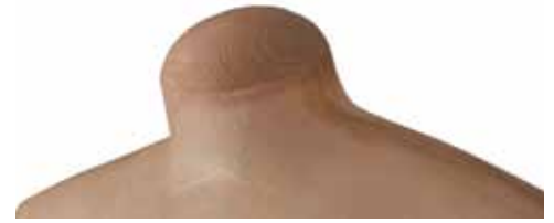
HALF ORB NECK

Turned beech wood available raw, waxed, stained or sprayed to a colour of your choice.