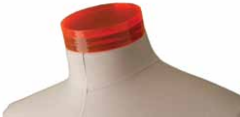
FLURO ACRYLIC NECK

Spectacular edge lit acrylic slices - highly polished to reflect light.