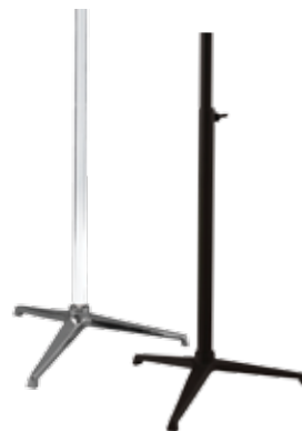
CAST IRON BASE Simple time-honoured design available raw, sprayed or chrome plated with steel or acrylic upright pole.