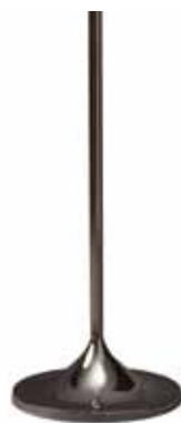
CHROME DROPLET BASE Classic beauty and symmetry combine in this elegant chrome plated design.