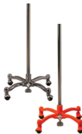
DRESSMAKERS BASE Classic wheeled design with removable pedal. Available raw, sprayed or chrome plated.