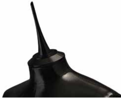
HORN FINIAL AND NECK

Collaged paper images beneath a satin seal. Specify exact images and design or ask us to follow a given theme.