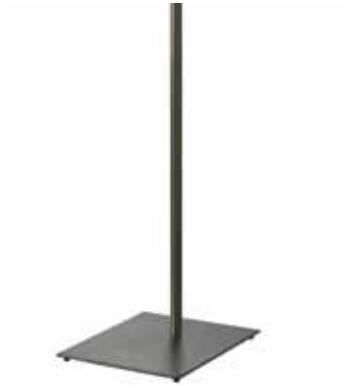
BRUSHED STEEL BASE Scoured steel plate raised on ball feet.