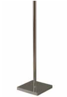
CHROME BLOCK BASE Chunky block design, cast and finished in shiny chrome.