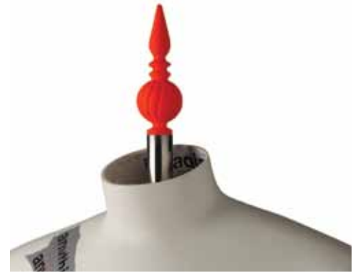
VINTAGE FINIAL / OPEN NECK

A modern take on the classic couture atelier neck. Available in raw cast metal or sprayed to a colour of your choice.