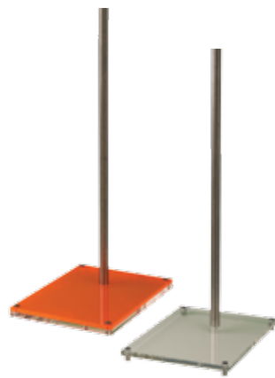
ACRYLIC BASE Acrylic baseplate with satin steel feet. Clear, coloured or edge lit neon.