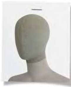
scrim covered head