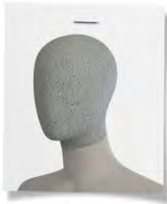
flecked spray head