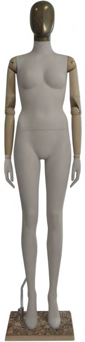
cork topped base VIN31F