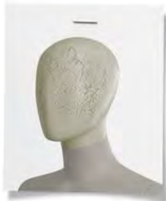
cream crackle glaze head