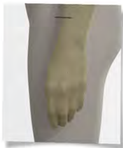
scrim covered hand