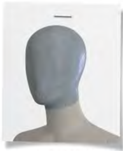
concrete coated head