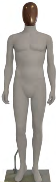
male figure HQM02