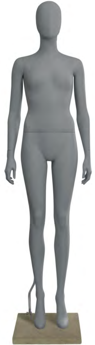
polished concrete base BAO12