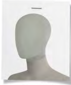
white RAW fiberglass head