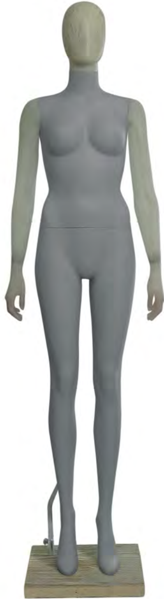
shuttered concrete BAO10