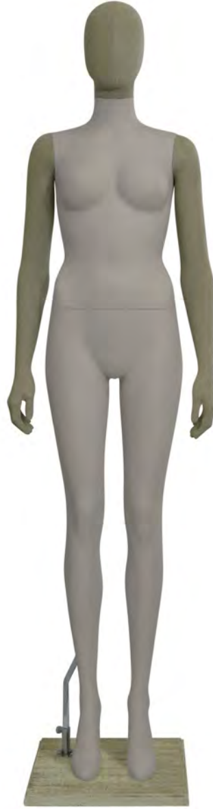
cream crackle glaze VIN31F