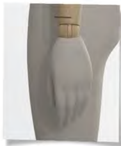
fixed finger hand option for articulated wooden arms