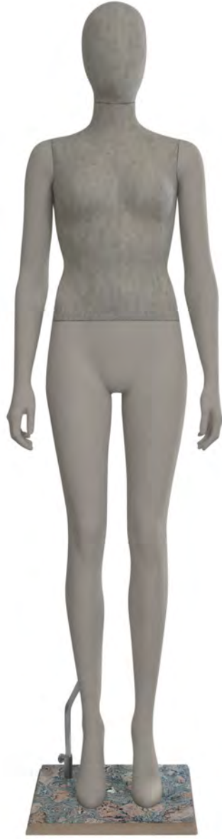
marbled cork topped base VIN31F