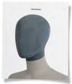
pigment stained head