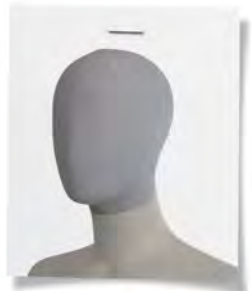
paint saturated upholstered head