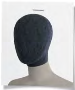
charcoal wool felt upholstered head