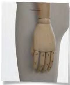
fully articulated wooden hand