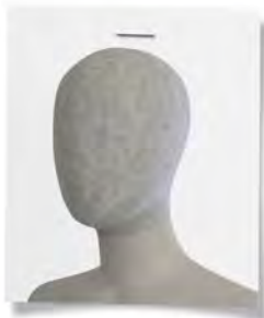
greige wool felt upholstered head