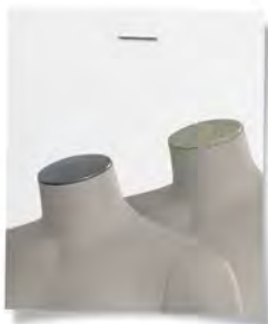
crackle glaze & metal finish neckcaps