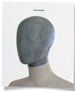
grey crackle glaze head