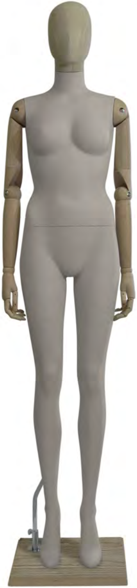
sandblasted wooden base VIN31F