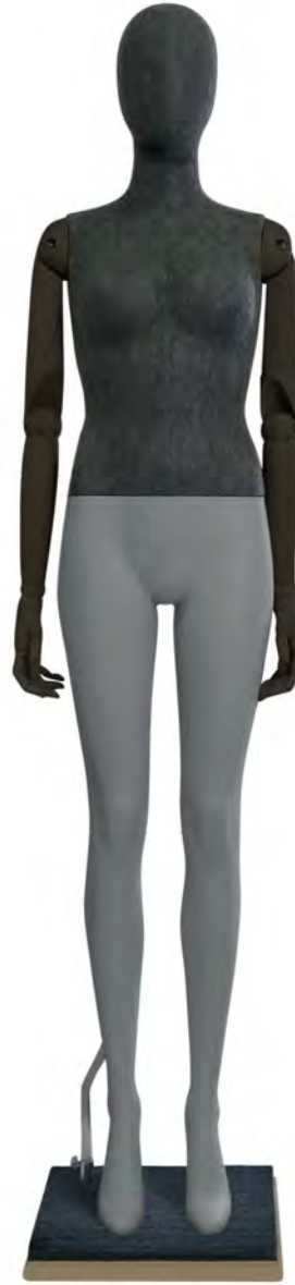
industrial felt topped VIN31F