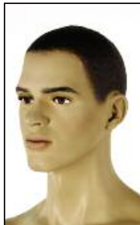
Head (B) Painted