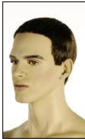
Head (A) Chad