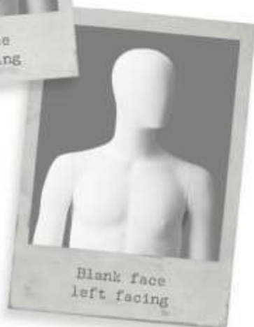
Blank face left facing