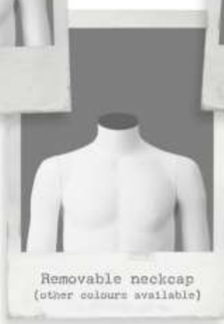
Removable neckcap (other colours available)