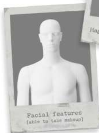
Facial features (able to take makeup)