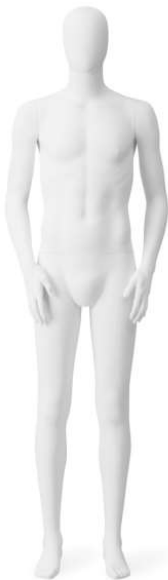
THE52 pocket hands