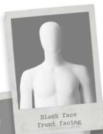
Blank face front facing