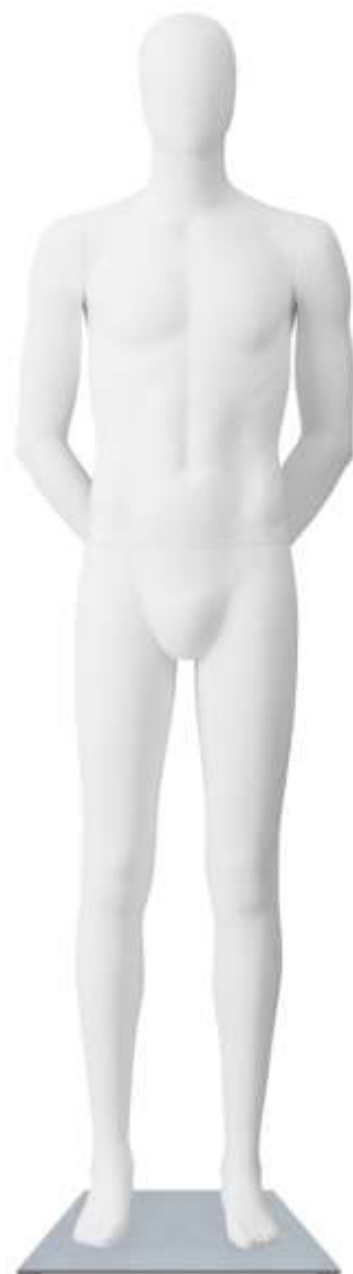
THE53 hands behind back shown with square metal base BAM27