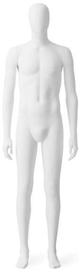
THE51 straight arms