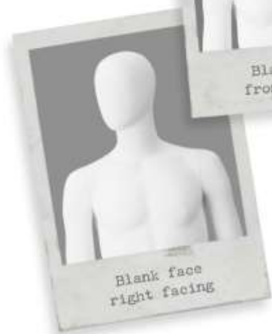
Blank face right facing