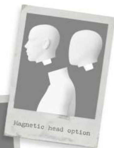
Magnetic head option